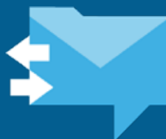
FILE BACKUP & COLLABORATION