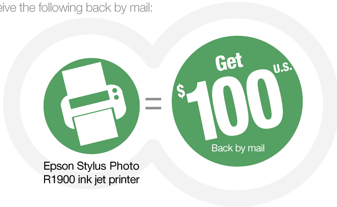
Epson Stylus Photo R1900 ink jet printer

PRODUCT MUST BE PURCHASED BETWEEN 12/6/09 AND 3/31/10.