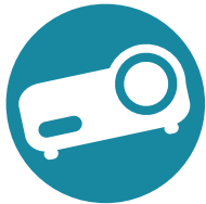
Epson PowerLite Home Cinema 720