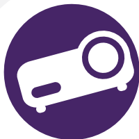
Epson PowerLite Pro Cinema 1080/1080 UB

Buy an Epson PowerLite® Pro Cinema 1080 or 1080 UB between September 1, 2008 and November 30, 2008 and receive the following: