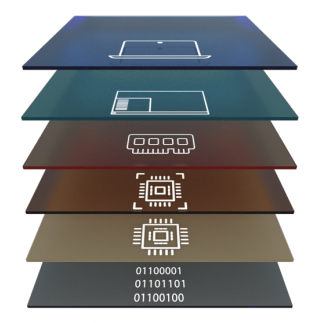
See endnote: GD-206, GD-202, GD-72

Provides a robust manageability feature set that simplifies deployment, imaging,