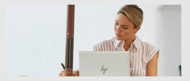
SENIOR LINE OF BUSINESS (Executives, Sales, Managers)

"I not only need to be productive everywhere, but I also need to easily transition from one location to the next. And whether I'm at home or on the road, I need secure access to my critical information. As a leader, I need to be assured of a realistic and commanding presence during video calls with colleagues or customers."