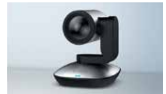
Sitting on table or ledge