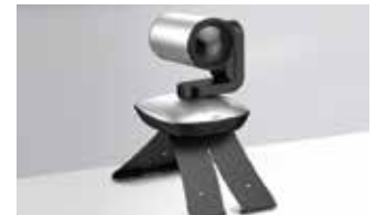
Elevated to eye height