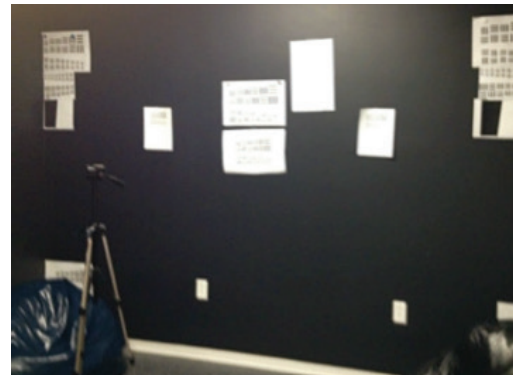
Logitech designs, tests, and refines ConferenceCam optics to optimize image quality factors such as sharpness, distortion, tone reproduction, color accuracy and dynamic range. Test patterns (like the Siemens Star shown here) are used for calibration, alignment, and troubleshooting the signal path as well as fine-tuning corner-to-corner sharpness

Logitech GROUP, here's a look behind the scenes at what it takes to bring it all together.