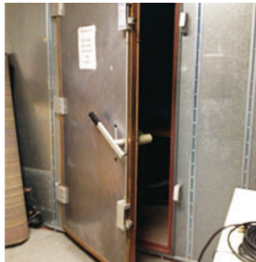
Beyond the door to this EMC chamber, Logitech performs tests to ensure compliance with international electromagnetic emission standards.

With ConferenceCam Connect, Logitech has introduced the ability to display content from a mobile device onto whatever HDMI-enabled screen