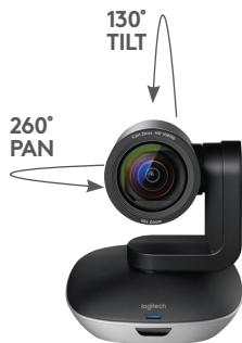
GROUP features a 260° pan range and the ability to tilt 130°, which provides an extra-wide visual range when meeting with mid-sized groups.

Logitech ConferenceCam cameras also pan, tilt, and zoom (up to 10x lossless HD zoom on GROUP). Greater visual versatility increases the quality of face-to-face interaction, which makes for better, more productive meetings.