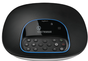
Logitech GROUP, like all Logitech ConferenceCams, includes a speakerphone.

Other business-grade audio enhancements include Digital Signal Processing (DSP) that enables precise tuning for both the mic and speaker so conversations sound more lifelike, wideband audio that ensures those on both sides of the call enjoy a rich, full-bodied listening experience, and acoustic echo cancellation and noise reduction technology to help users hear and be heard even in noisy workspaces.